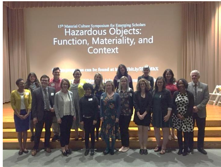
Group picture of all the attendants and organizers of the Hazardous Objects symposium